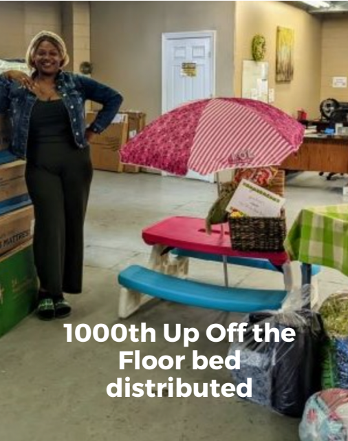
1000th Up Off the Floor bed distributed