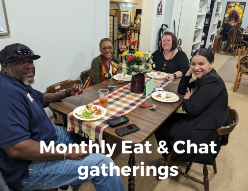
Monthly Eat & Chat gatherings