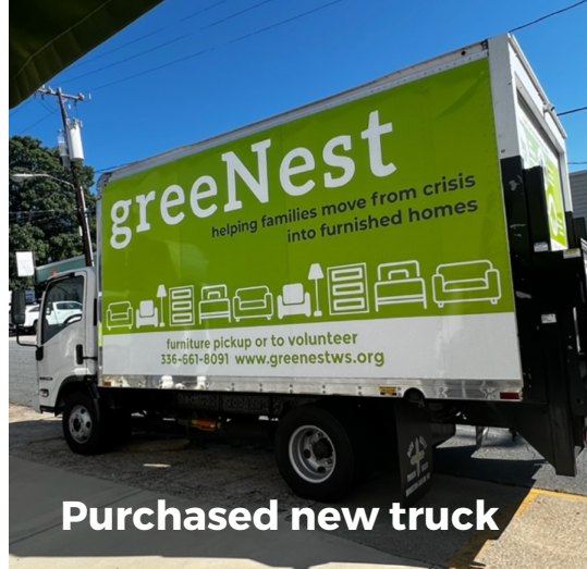
Purchased new truck