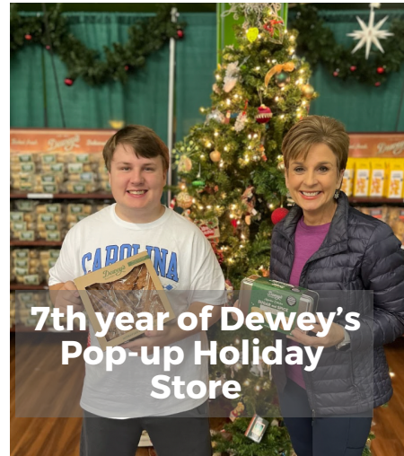
7th year of Dewey's Pop-up Holiday Store