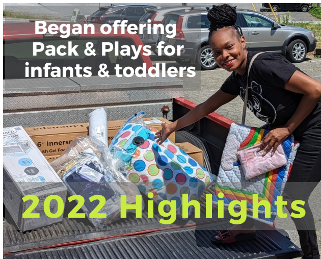
Began offering Pack & Plays for infants & toddlers