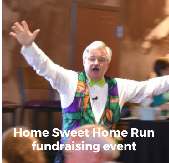
Home Sweet Home Run fundraising event